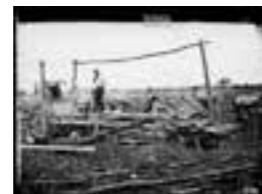
Pitsawing timber, Gulgong 1872 a2822085