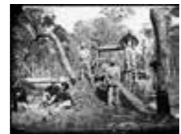
Gulgong miners 1872 a2824746