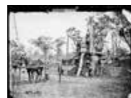
Gulgong mining 1872 a2822380