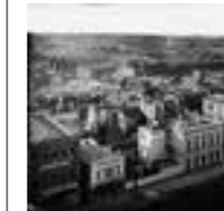
View across Ballarat 1874 a2825398