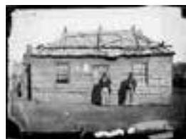
The detectives, Gulgong 1872 a2822182