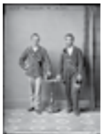
White and Hewitt 1873 a2823715