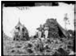
Miner's camp, Hill End 1872 a2822650