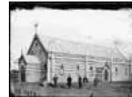
Catholic Church, Gulgong 1872 a2823013 and a2822050