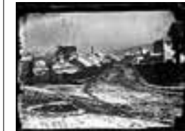
Snowstorm in Clarke Street, Hill End 4 October 1872 a2822737