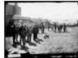
Herbert Street, Gulgong 1872 a2822178