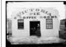
J Green's Pie and Coffee Rooms, Hill End 1872 a2822409