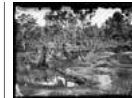
Gold sluice and tailings, Home Rule 1872 a2822198