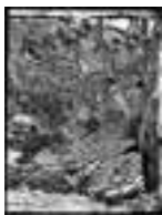
Gold miner's hut, Hill End 1872 a2822942