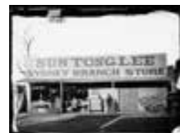
Chinese store, Gulgong 1872 a2822392