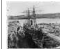
French warship in Sydney 1873 a2825357