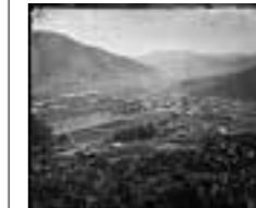
Panoramic view of Bright, Victoria 1874 a2825284