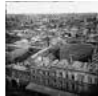
Panorama of Ballarat 1874 a2825394