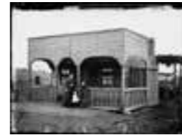
J Heins's cottage, Gulgong 1872 a2822123