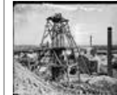
Goldmine, Bendigo 1874 a2825246