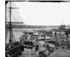
East Circular Quay 1873 a2825071