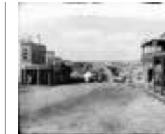
Darling Street, Balmain a2825027