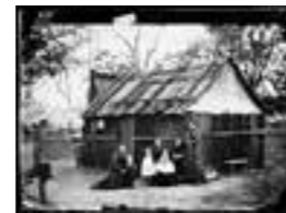
Bark hut with women and children, Gulgong 1872 a2822348