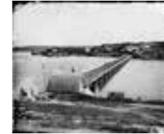
Glebe Island Bridge 1873 a2825010