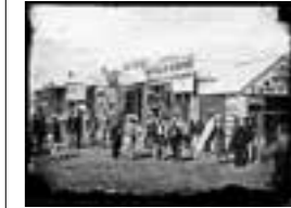
Short Street, Hill End 1872 a2822400