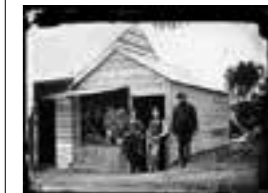
Lysaught's butcher shop, Hill End 1872 a2822439