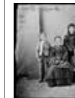
Dingle family 1873 a2824015