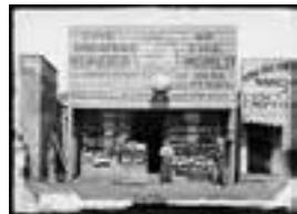
The Greatest Wonder of the World, Gulgong 1872 a2822094