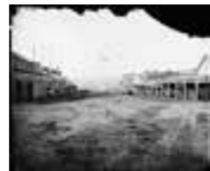
★ Mair Street, Ballarat West 1874 a2825252