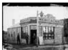
Charles Bird's Medical Hall, Gulgong 1872 a2822112