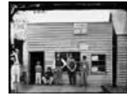
Hill End School and pupils 1872 a2822686