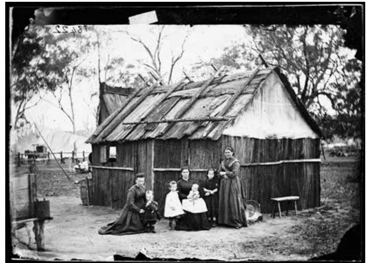
ABOVE: HERBERT STREET, GULGONG 1872, AND DETAIL OPPOSITE ABOVE: WATTLE AND DAUB HUT, HILL END 1872 OPPOSITE BELOW: BARK HUT WITH WOMEN AND CHILDREN, GULGONG 1872 PAGE 20: GOLDMINE, BENDIGO 1874