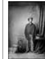
C War 1873 a2823968