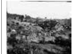
Gold mines, Hawkins Hill and Nuggetty Gully 1872 a2824811