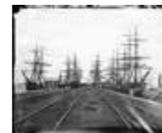
Railway Pier, Williamstown 1874 A2825207