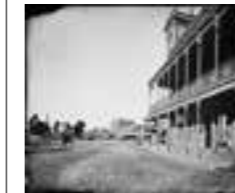
Pall Mall, Sandhurst [Bendigo] 1874 a2825413