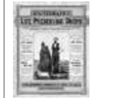
Holtermann's Life Preserving Drops 1875 Posters/Medicine/8