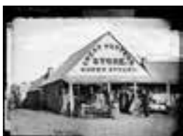
Great Western Store, Hill End 1872 a2822490