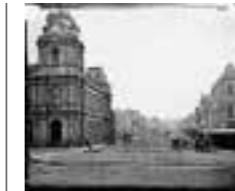
Bourke Street, Melbourne 1874 a2825110