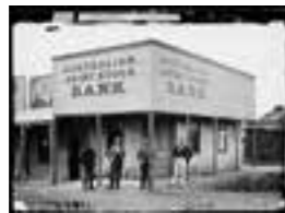
Australian Joint Stock Bank, Gulgong 1872 a2822063