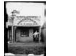
Gulgong Dispensary 1872 a2822223