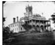
★ Holtermann's mansion, St Leonards 1875 a2825104