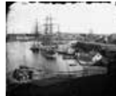
Circular Quay from Dawes Battery 1873 a2825014