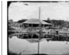
Pullen and Rawsthorne's new gold crushing mill, Hill End 1872 a2824810 and a2825334