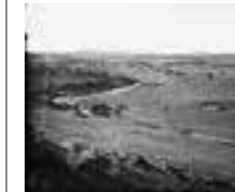
Panorama of Yass district 1874 a2825290-3