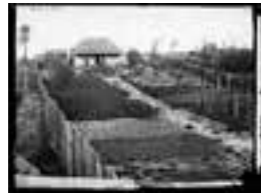
A domestic miner, Hill End 1872 a2822867