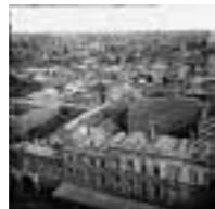
★ Panorama of Ballarat 1874 a2825394