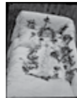
Postmortem portrait a2824425