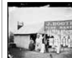
Tent city, Home Rule 1872 a2822219