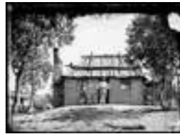
Wattle and daub hut, Hill End 1872 a2822616