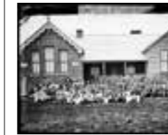
Hill End School and pupils 1872 a2822686