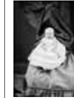
Alice Grotefent on her mother's lap 1872 a2823180