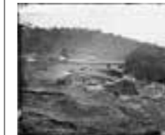
Brickmaking, Carcoar 1873 a2824845