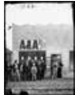
The A&A Photographic Company, Hill End 1872 a2822709