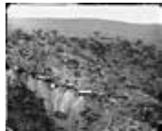
Hawkins Hill 'Golden Quarter Mile' 1872 a2825324