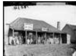
★ All Nations Hotel, Hill End 1872 a2822524