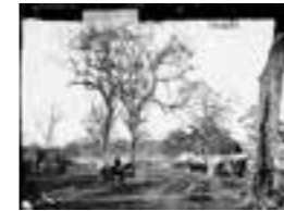
Main Street, Canadian Lead 1872 a2822331