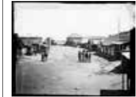
View of Clarke Street, Hill End 1872 a2822795