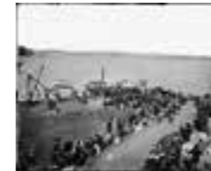
Funeral of Commodore Goodenough 1875 a2825417