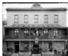
★ Post Office Hotel, Sydney April 1874 a2825414