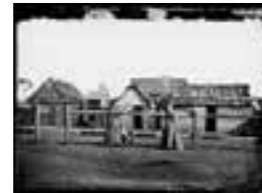
The Lawson family, Gulgong 1872 a2822303