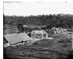
★ Belubula Street, Carcoar 1873 a2824841