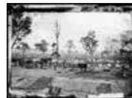
Puddling machines, Gulgong 1872 a2822387