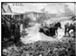
Clarke Street, Hill End 1872 a2822718