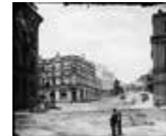
Looking up Hunter Street, Sydney a2825035