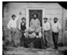
★ Gold specimens from the Star of Hope mine 1872 a2825335