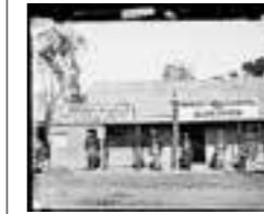
Prince of Wales Hotel, Home Rule 1872 a2822210