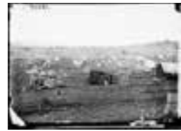
View of Gulgong from Church Hill 1872 a2822266