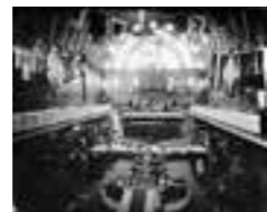
Interior Exhibition Hall, Sydney 1875 a2825407